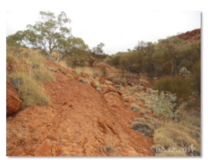
Photo 2: Detectorist at alluvial workings overlying Hardey Conglomerate at Beasley Central