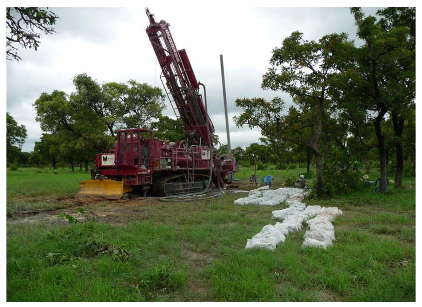
Follow-up RC Drilling at Baayiri prospect June 2011