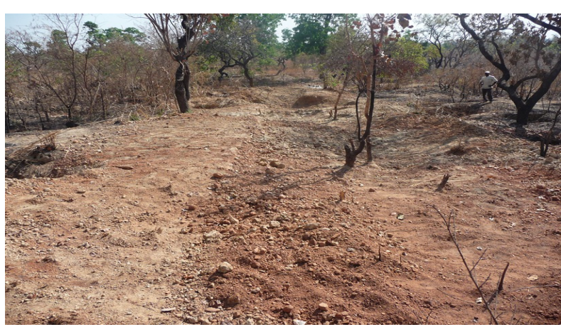
Backfilled trench at Bulenga Prospect