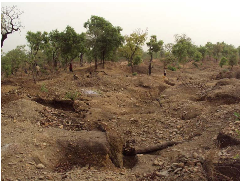
Artisanal gold workings at south west end of the Kandia Prospect

A soil geochemical sampling program has just been completed along strike from the Kandia workings testing a 10km long prospective corridor - assay results are pending.